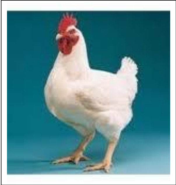
Cobb 500 Broiler